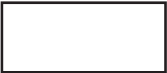
BASE SIDE VIEW