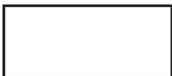
BASE SIDE VIEW